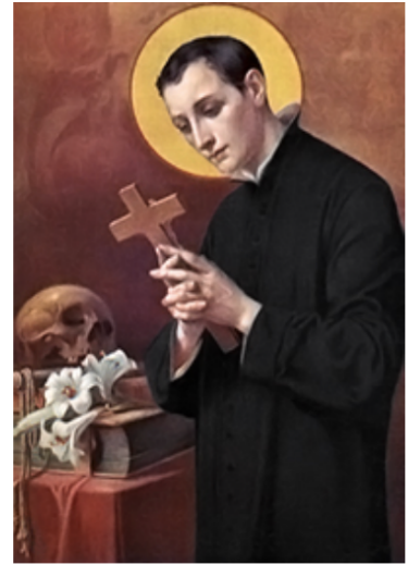
MARCH 9, 1568 – JUNE 21, 1591

We, as a Christian Community, inspired by the Holy Spirit, strive to live our Baptismal Promises by using our time, talent and treasure to reach out to others as Jesus did.