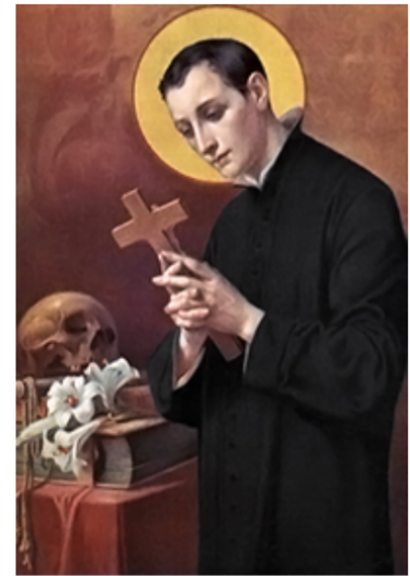
MARCH 9, 1568 – JUNE 21, 1591

We, as a Christian Community, inspired by the Holy Spirit, strive to live our Baptismal Promises by using our time, talent and treasure to reach out to others as Jesus did .