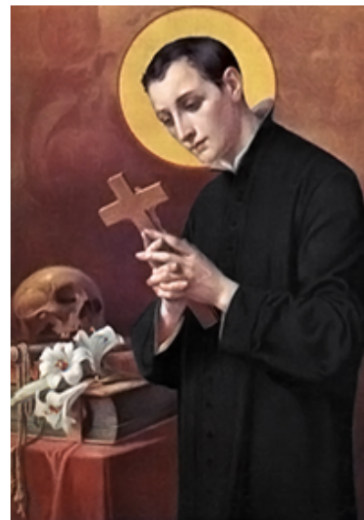
MARCH 9, 1568 – JUNE 21, 1591

We, as a Christian Community, inspired by the Holy Spirit, strive to live our Baptismal Promises by using our time, talent and treasure to reach out to others as Jesus did.