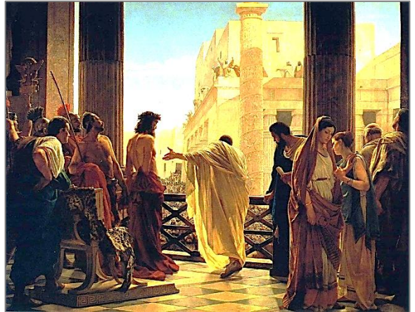
Ecce Homo (Behold the Man!), by Antonio Ciseri, c. 1871

Lord, in the midst of all the noise and distractions of this world, we find it hard to hear your voice. Open our ears, that we may hear and take account of your word. This we pray in Jesus' name. Amen.