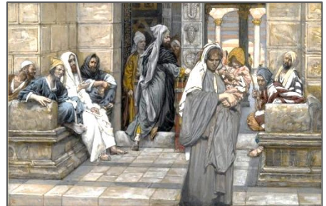
The Widow's Mite (Le denier de la veuve), by James Tissot, c. 1886-1894

Jesus, help us to be alert to our selfishness and our judgemental attitudes towards others. We remember St Ignatius' prayer, "Take, O Lord, and receive my entire liberty, my memory, my understanding and my whole will. All that I am and all that I possess you have given me: I surrender it all to you to be disposed of according to your will. Give me only your love and your grace; with these I will be rich enough, and will desire nothing more." In Christ's name, Amen.