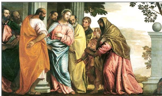
Christ Meeting the Wife and Sons of Zebedee, by Paolo Veronese, c. 1565