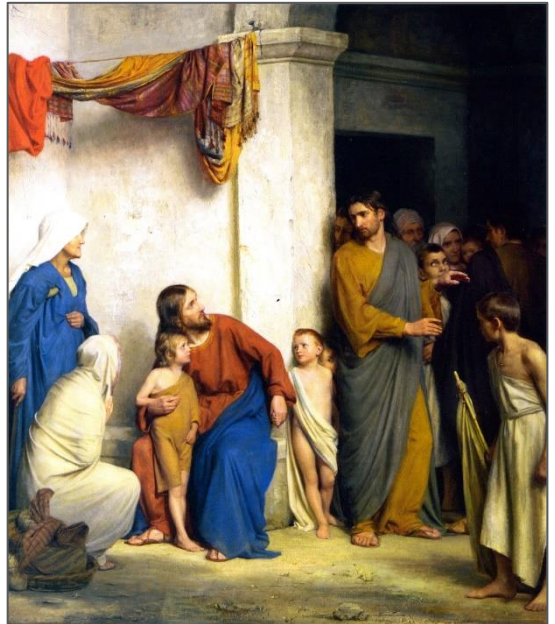
Jesus with the children, by Carl Bloch (1834-1890), c.1800s

Lord, when suffering or betrayal come my way, let me offer them lovingly to you. Let me believe that my unavoidable sufferings, patiently and lovingly endured, play their part in the saving of the world. Amen.