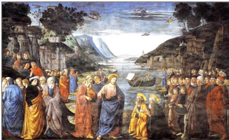
Vocation of the Apostles, by Domenico Ghirlandaio, c. 1481

The teaching that God's love is present in welcoming strangers and neighbours has been a strong belief of many cultures. The Indian writer, Rabindranath Tagore, tells us that when people left his hut, he found "God's footsteps on the floor". The Divine lives in each of us, and when we welcome each other we welcome God, and Jesus, the Son of God. This is the welcome of the church to all. Too often the church has been choosy about who to welcome or not welcome to the table of the Lord or even to the community. Our country can be overly particular in welcoming the stranger in need. A call to the church today is to welcome all and be enriched by the variety of prayer, friendship and worship which all can bring.