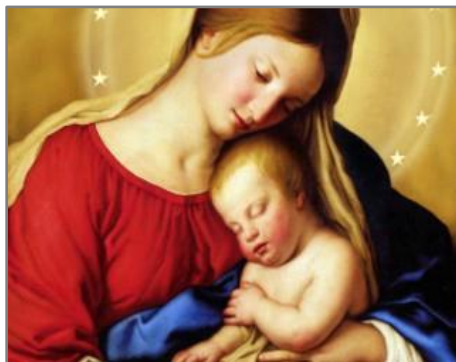
Adaptation of Madonna and Child with Cherubs, 1674, by Giovanni Battista Salvi

Mary, on this day when we honor all mothers, we turn to you. We thank the Lord whom you serve for the great gift of motherhood. Never has it been known that anyone who sought your intercession was left unaided by grace. Dear Mother, thank you for your "Yes" to the invitation of the angel which brought heaven to earth and changed human history. You opened yourself to God's word and the Word was made flesh and dwelt among us.