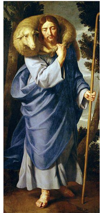
Good Shepherd , 17th Century Jean Baptiste de Champaigne.

I pray for humility, that I may be led; for trust, that I may follow in faith; for purity of heart, that I may not be distracted from the Shepherd's voice. Amen.