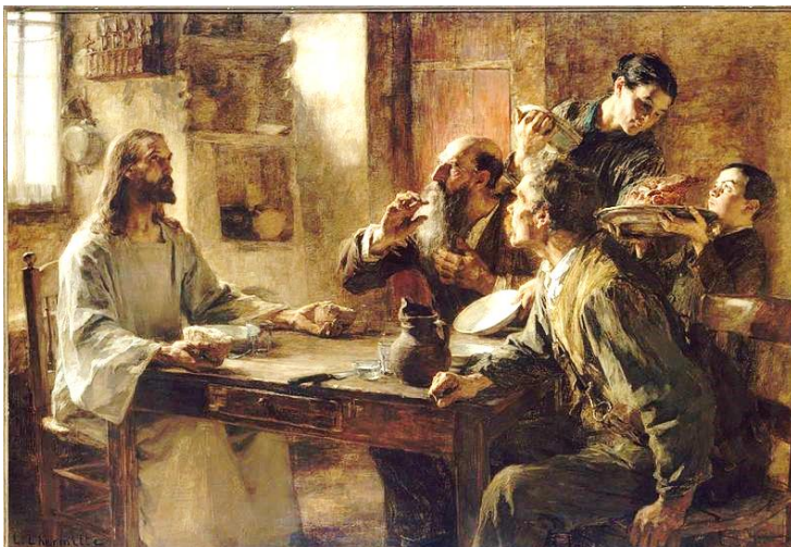
Friend of the Humble (Supper at Emmaus), 1892, Léon-Augustin L'hermitte.

Lord, you wish me to leave the safety of my private upper room and meet you as you come to me daily in the streets. But first let me be with you in prayer, waiting for the power of your Holy Spirit. Armed with this gift let me go forth to witness to you in word and deed. Amen.