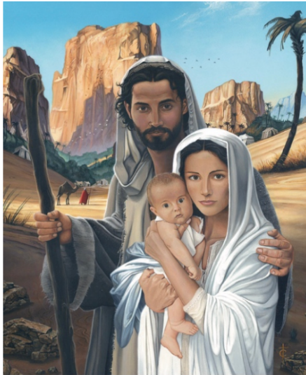
Saint Joseph, guardian and protector of the Holy Family, pray for us!

But there is more than this. Joseph was a poor carpenter from Nazareth. It took him years to save the money required to marry, and he could not marry in a family much wealthier than his own. It is also suggested that he was much older than Mary, who was probably 12 years old, or perhaps 14 at best. She needed to marry so that someone else could look after her. And then, he found out she was with child! His dream was over. But God told him to take her for his wife, even with him knowing he was not the father. His life's ambition, to have a child of his own, was thwarted by God. No; you will not have a descendant! Even that was taken away. He would have to look after a girl who was carrying someone else's child, and care for the child himself. Joseph knew what adversity was, what it meant to face a very difficult life; dreams were made to be broken. As the song says: «You can't always get what you want.» Instead of rebelling, he simply accepted what God imposed on him. He looked after the girl and her child the best way he could. He protected them by taking them to Egypt. He protected them by his work. He loved them as