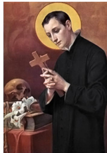
MARCH 9, 1568 – JUNE 21, 1591